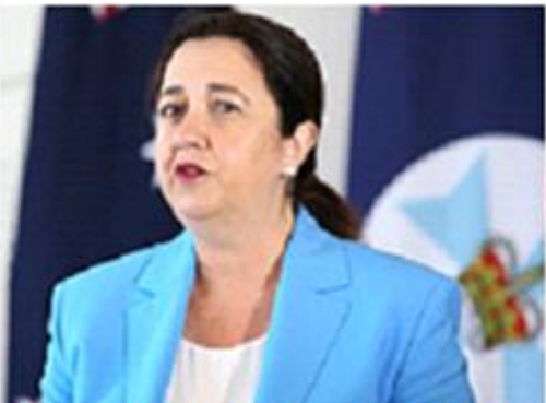
Traitor to the People stands for the people in front of Treasonous Flag