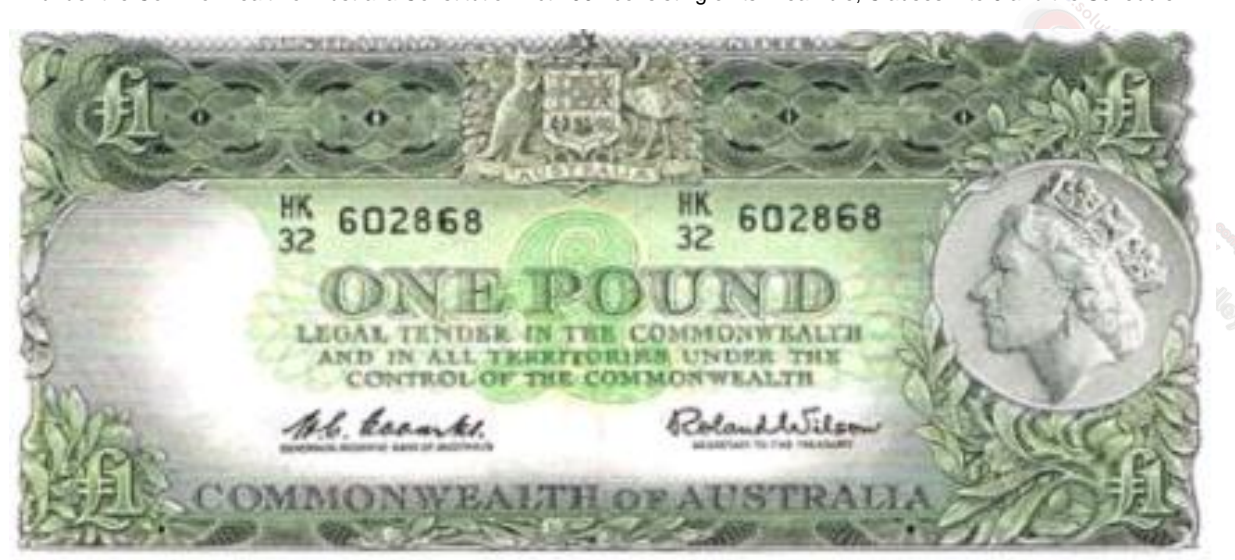
Legal tender guaranteed by the "Crown" and the "Commonwealth of Australia"