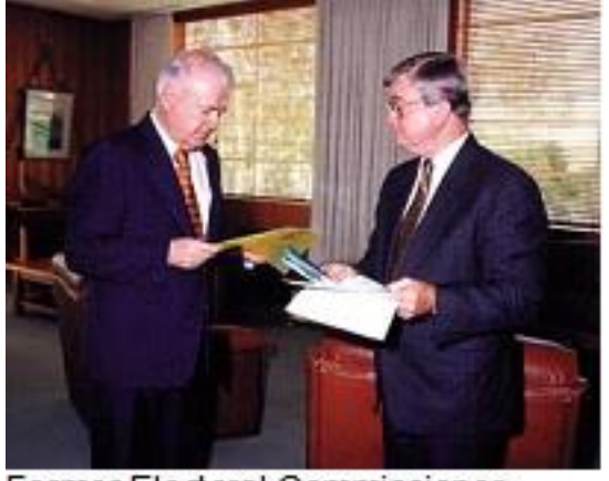
Former Electoral Commissioner Bill Gray returns the writs for the 1999 referendum to the Governor-General, Sir William Deane.

No States recorded a YES vote. Nationally 39.34% of electors voted YES.