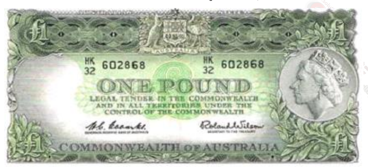
Legal tender guaranteed by the "Crown" and the "Commonwealth of Australia"