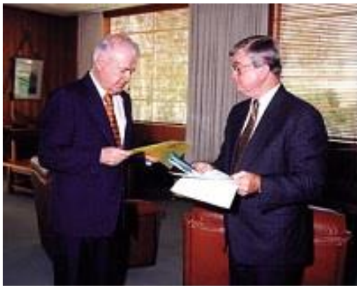
Former Electoral Commissioner Bill Gray returns the writs for the 1999 referendum to the Governor-General, Sir William Deane.

No States recorded a YES vote. Nationally 39.34% of electors voted YES.