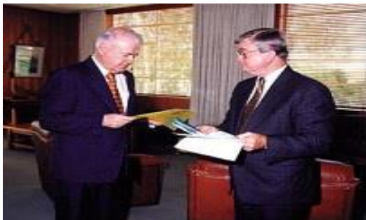
Former Electoral Commissioner Bill Gray returns the writs for the 1999 referendum to the Governor-General, Sir William Deane.

No States recorded a YES vote. Nationally 39.34% of electors voted YES.